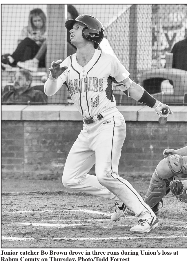
Rabun County on Thursday.